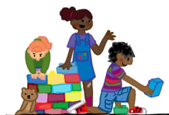
Education Works in Preschool