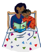
Big Bedtime Read

On the Dashboard , you will notice that we have included each of the Getting Ready to Learn themes, and have created topic sub folders so that it is easy to find the ideas and resources you need.