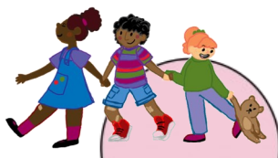
Happy Healthy Kids